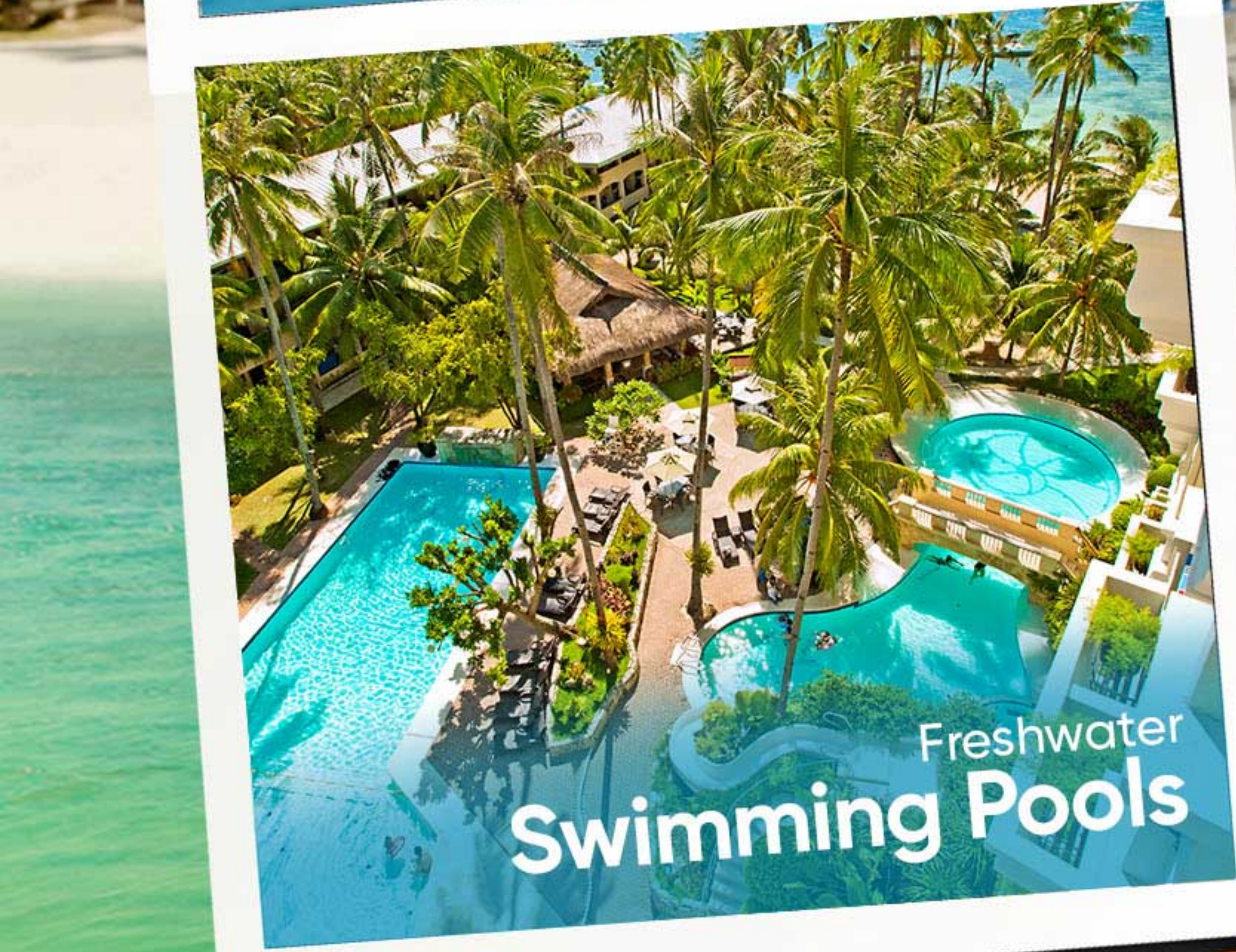
Freshwater Swimming Pools