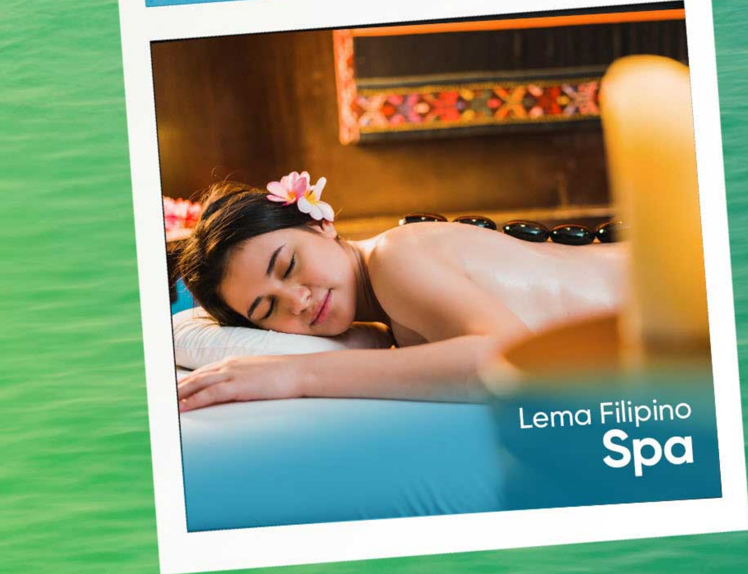
Lema Filipino Spa