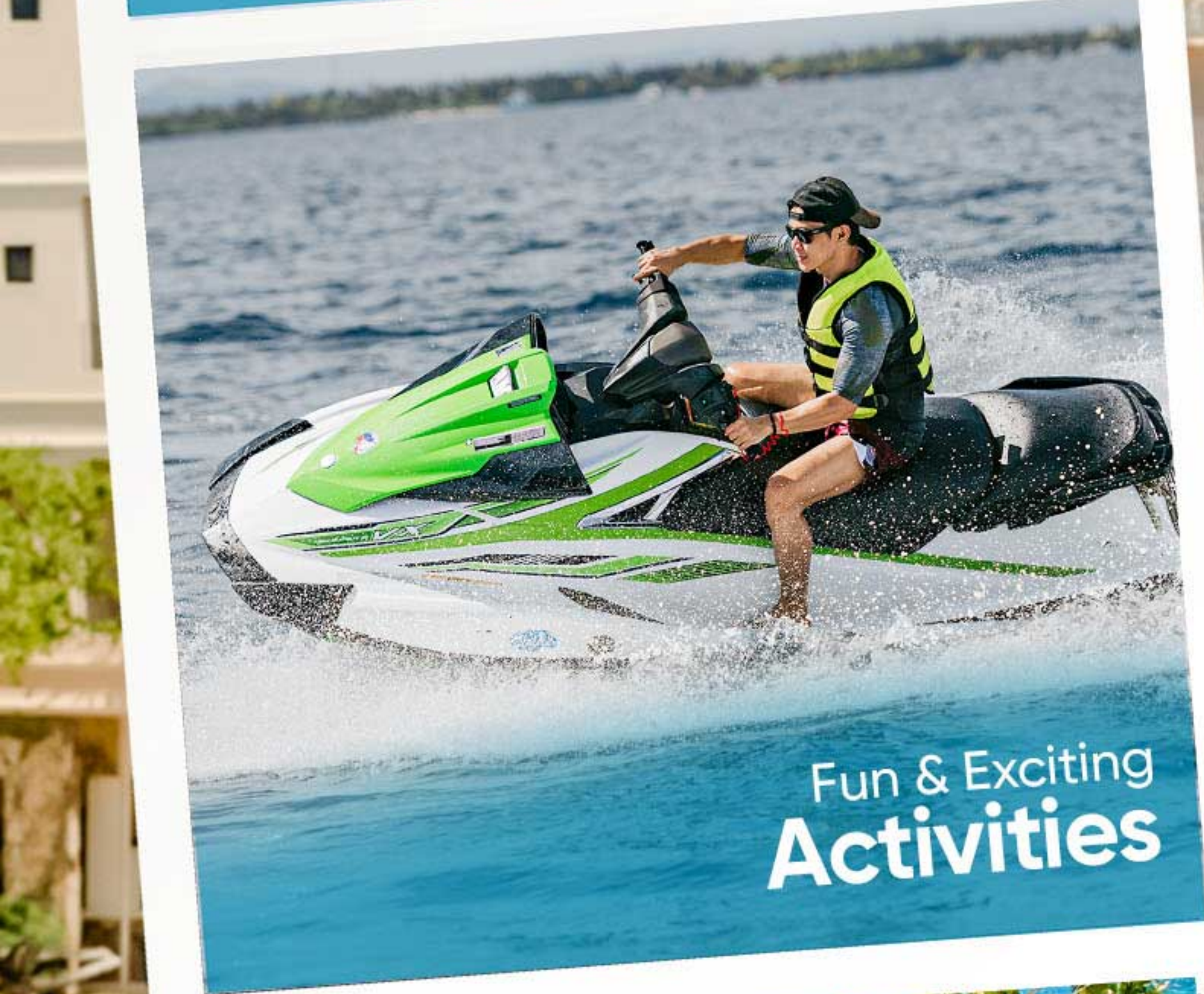
Fun & Exciting Activities