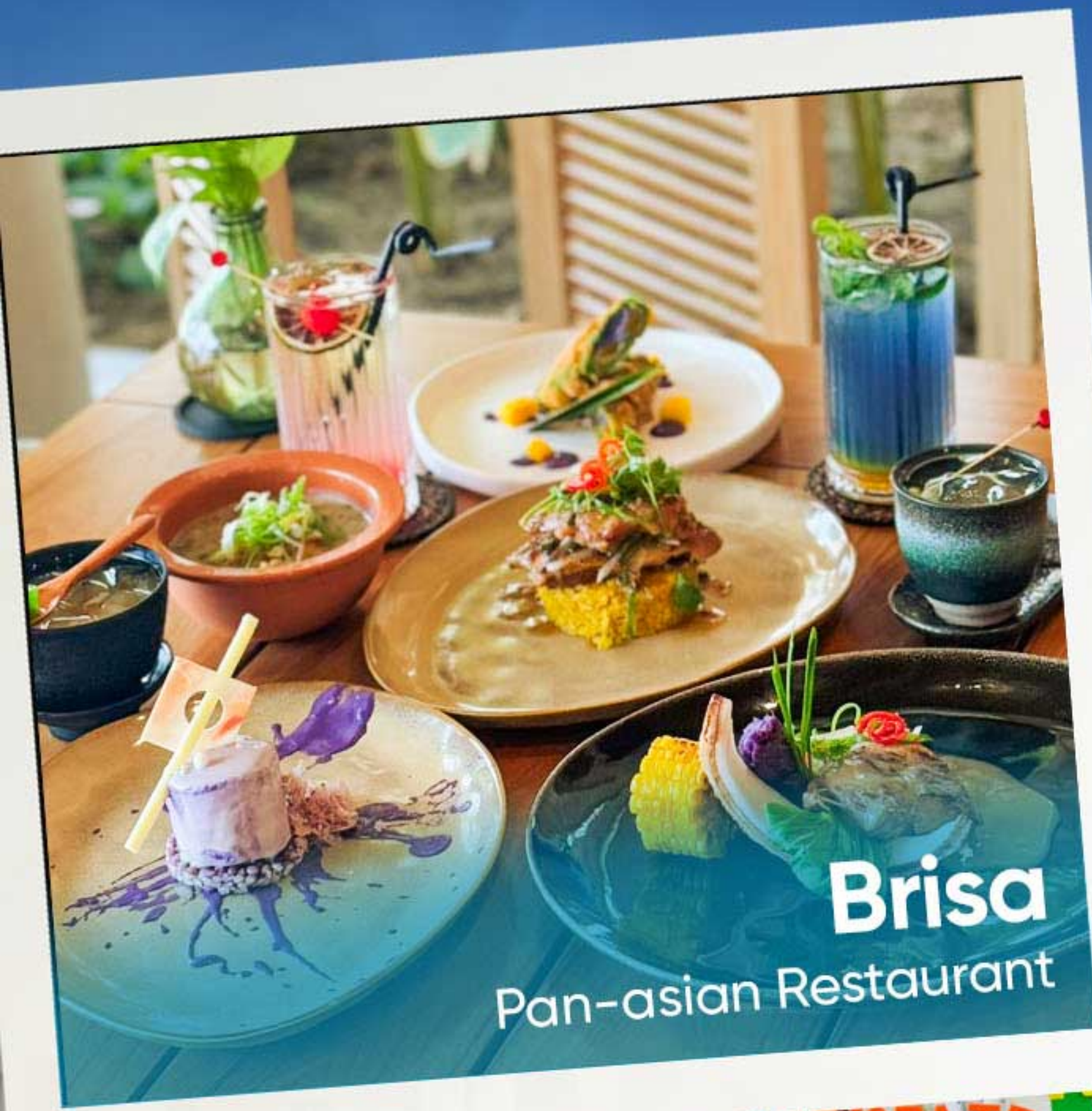
Brisa Pan-Asian Restaurant